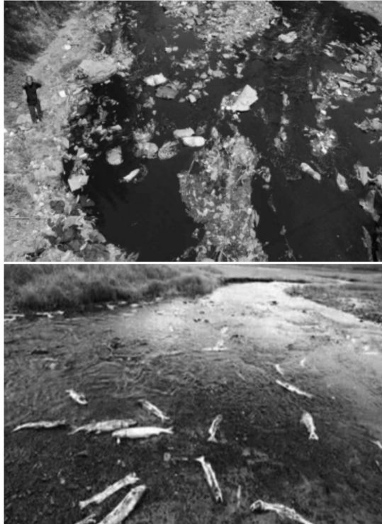
Fig. 1. Current situation of organic pollution in rivers

It is generally believed that rivers are naturally flowing water that has a considerable amount of water on its surface or perennial or seasonal. Some scholars believe that the urban river water environment covers the city's linear water (natural rivers, artificial channels, and moat) and the composition of the water cycle space. Compared with natural rivers, urban rivers and regional human activities interact greatly [7]. On the one hand, the region's healthy rivers provide a variety of services for socio-economic activities [8]. On the other hand, the river water, water cycle, water quality, health conditions are also affected by high-intensity social and economic activities. With the rapid growth of population and the rapid development of economy, more and more pollutants are discharged into rivers, much more than the self-purification capacity of rivers [9]. In addition, due to changes in environmental conditions, river pollutants enter the river bed sediments, with the river water temperature, change of pH and biodegradation, the function of water flow back to the river makes it difficult to control the source of pollution, the concentration of dissolved oxygen in highly polluted river water is very low, or even zero, which causes the smell of rivers, or even massive death of fish, and seriously damages the river's ecosystem. The specific pollution phenomenon is shown in Fig. 1.